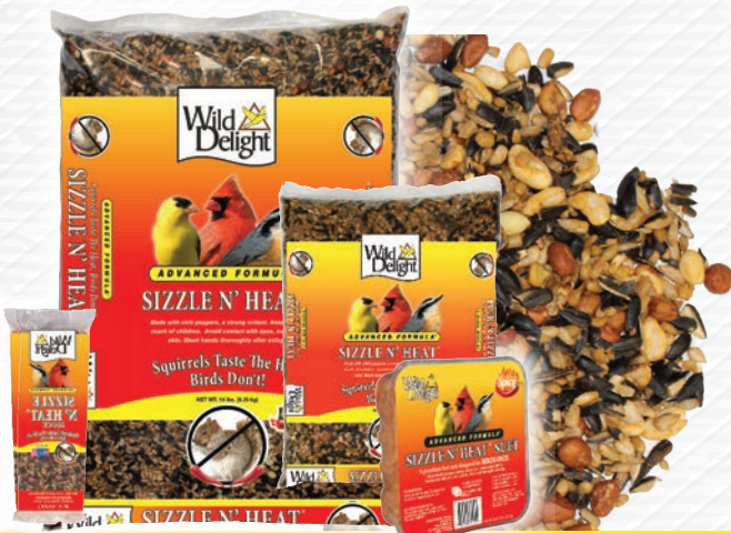
Sizzle N' Heat®