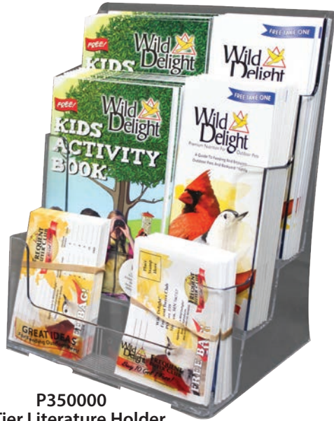
P350000 3-Tier Literature Holder

Please display holder with kids activity books, consumer guides, and Frequent Buyer Club envelopes on shelf in prominent area of Wild Delight section. Please see image for illustration. Holders are securely fastened together with connectors (included).