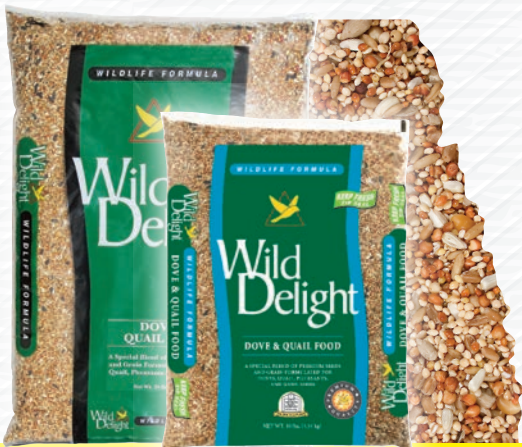
Dove & Quail Food