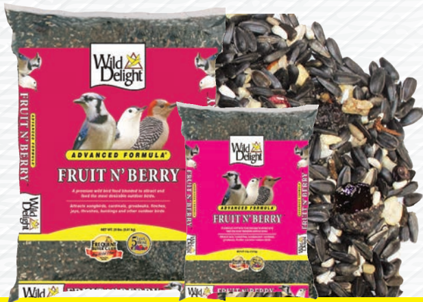
Fruit N' Berry™