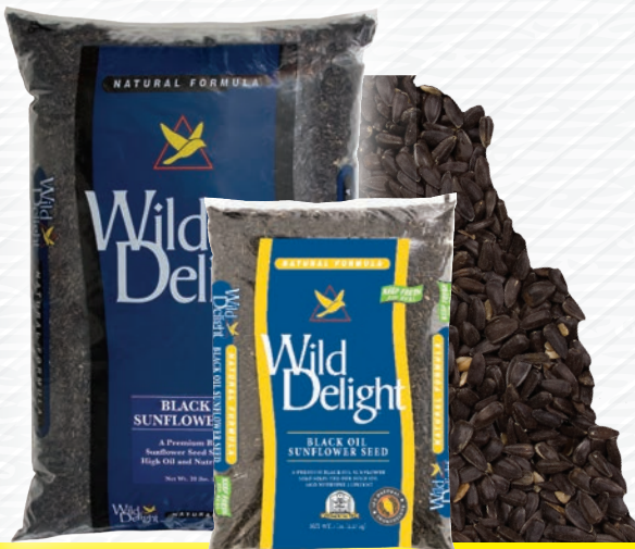
Black Oil Sunflower Seed