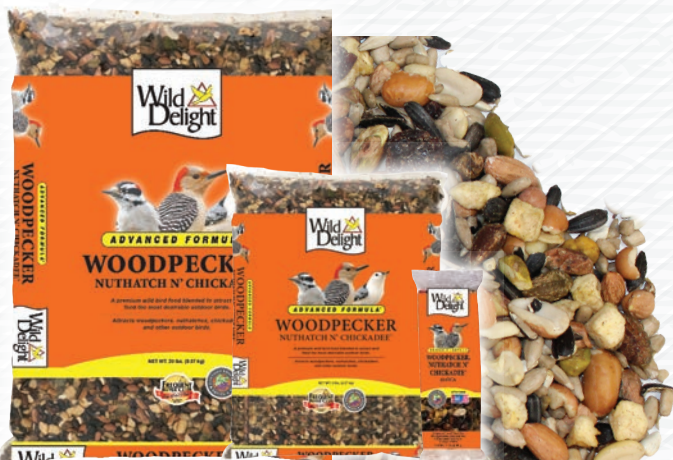
Woodpecker, Nuthatch N' Chickadee®