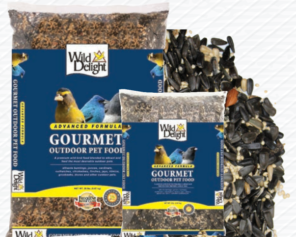
Gourmet Outdoor Bird Food