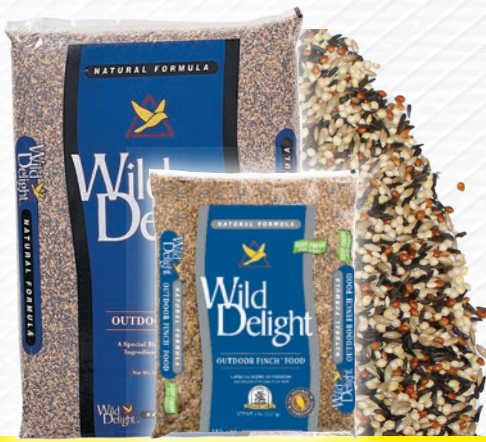
Outdoor Finch Food