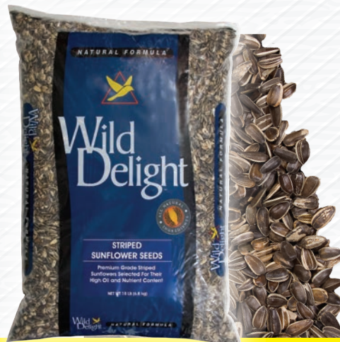
Striped Sunflower Seed