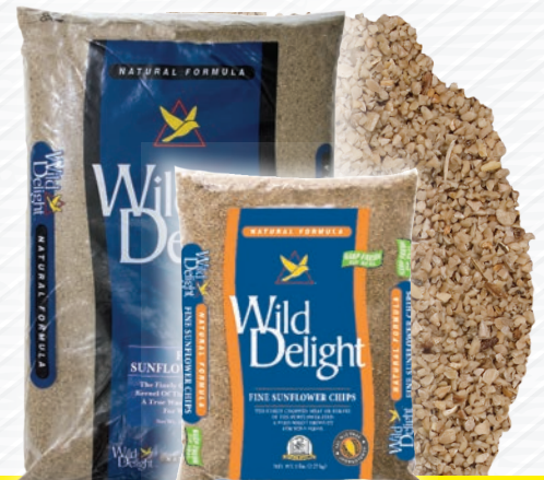
Fine Sunflower Chips