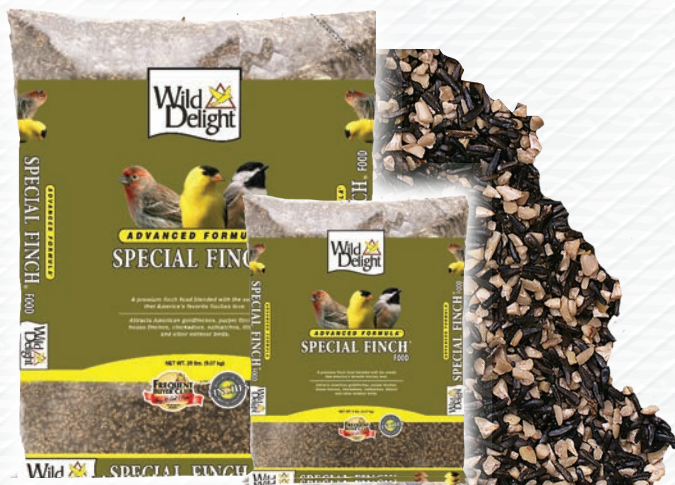
Special Finch® Food