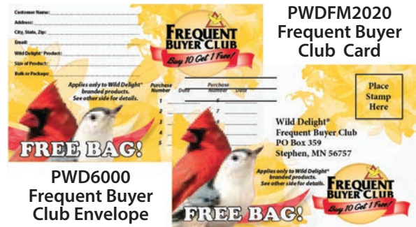
PWD6000 Frequent Buyer Club Envelope