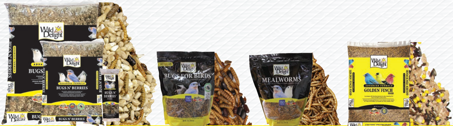
Bugs N' Berries®