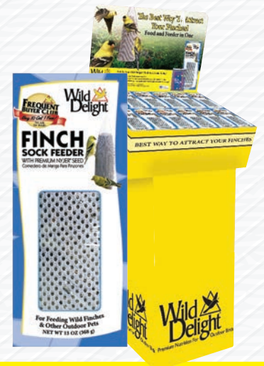
Finch Sock Feeder And Display