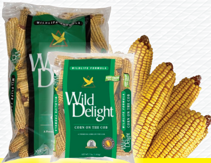
Corn On The Cob