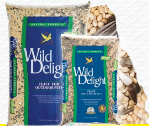
Feast® For Outdoor Birds