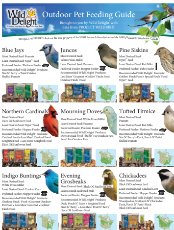
PWDBR0380 Laminated Feeding Chart

Hang with provided chain to shelf in prominent area of Wild Delight® section.