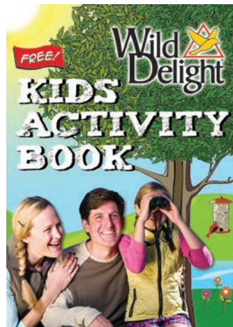
PWDPA0400 Kids Activity Book