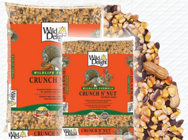
Crunch N' Nut® Squirrel Food