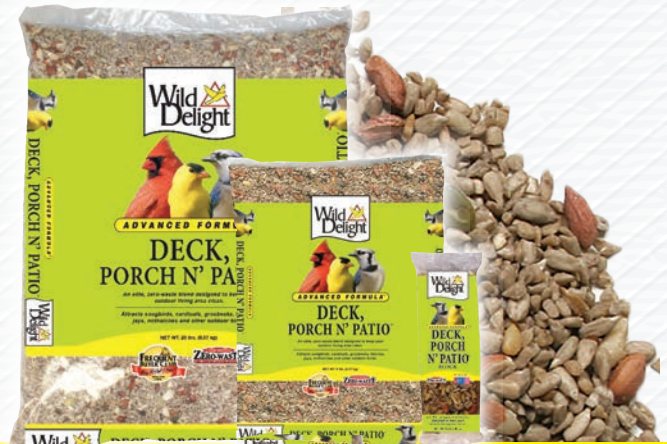
Deck, Porch N' Patio®