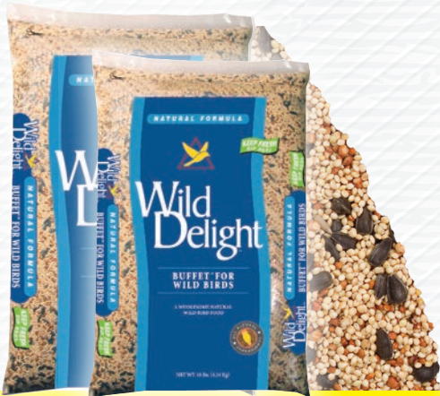
Buffet® For Outdoor Birds