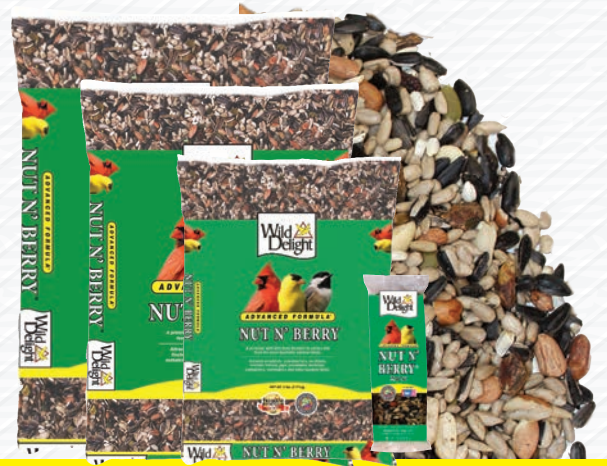
Nut N' Berry®