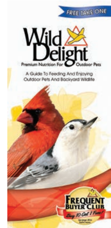
PWDMC0500 Consumer Guide