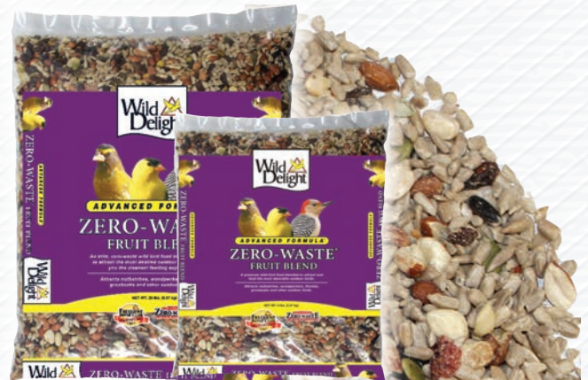
Zero-Waste® Fruit Blend